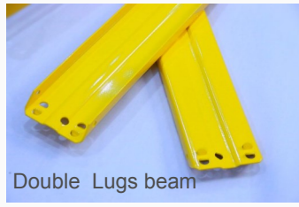
Double Lugs beam